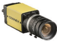
In-Sight 8000 Series